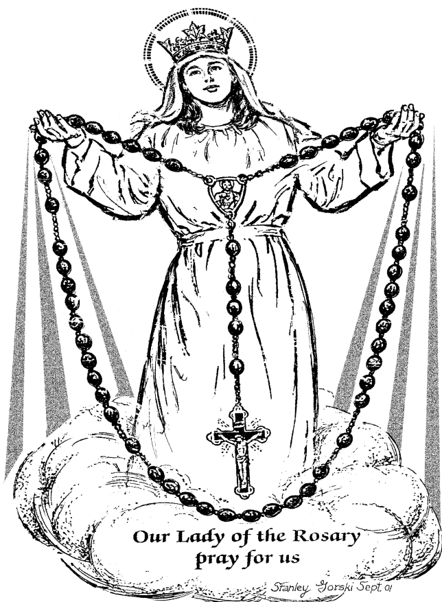
Our Lady of the Rosary pray for us

Please remember, just a few hours a week or month, could help a Mom and save a Baby!